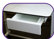
HQ InSight™ Table Drawer